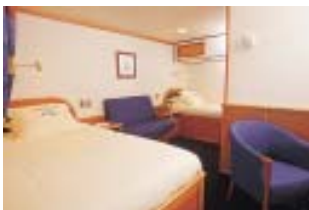
Type 1 Cabin