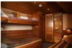
Iguana Deck Cabin

Each cabin has a private bathroom with a hot-and-cold-water shower, climate controls, intercom system, hair dryer, and toiletries.