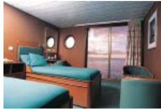
Boat Deck Superior Cabin