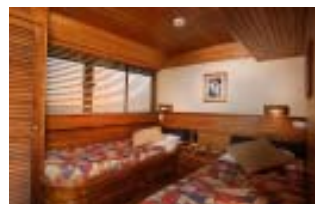
Dolphin Deck Cabin