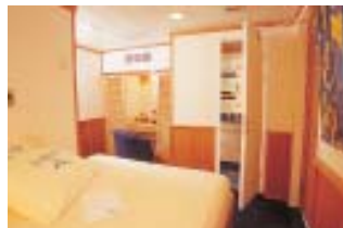
Type 2 Cabin