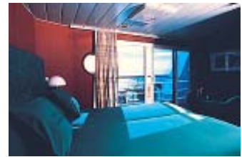
Boat Deck Master Suite