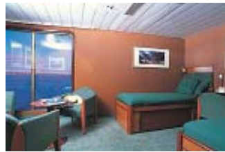
Boat Deck Junior Suite