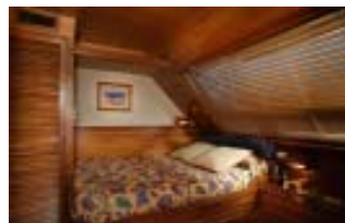
Booby Deck Cabin